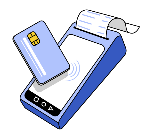
Payment is due on the day of service unless you are Plan Managed.