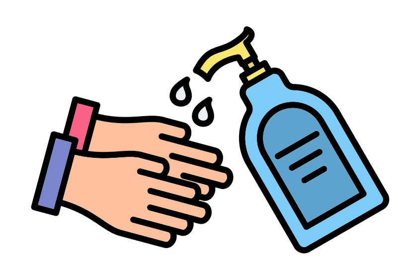
Please sanitise your hands on arrival.