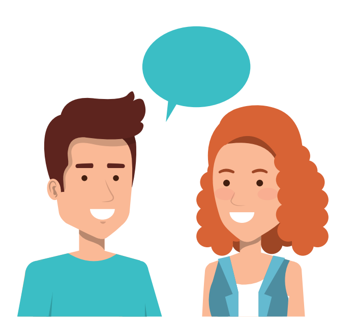
Respectful and polite interactions with our team at all times - we're here to help.